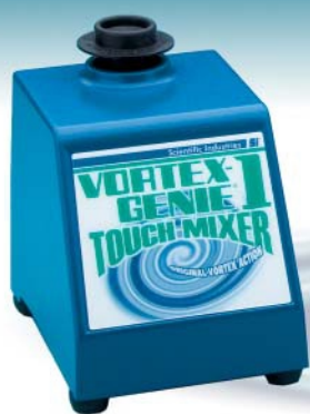
HIGH SPEED MIXER