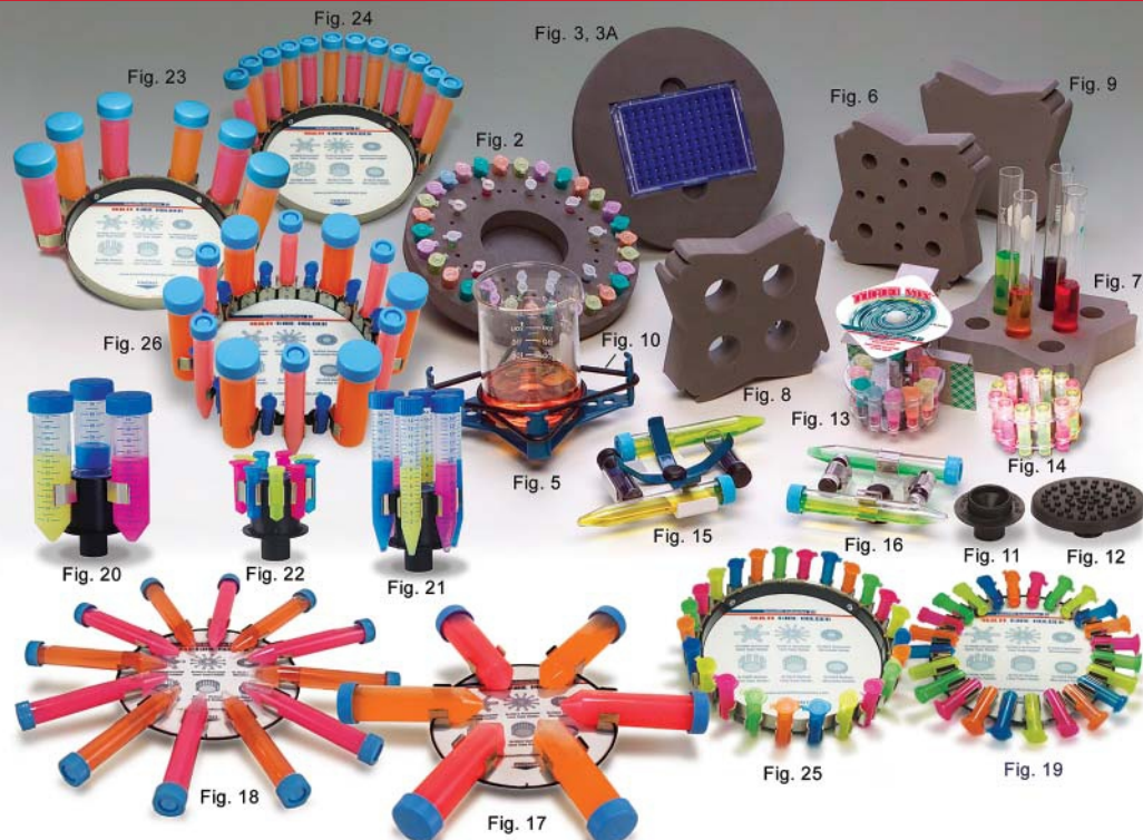
Fig. 1 Model H301 Multiple Sample Starter Set

Accessories for all Vortex-Genie® mixers and Vortex-Genie®Pulse